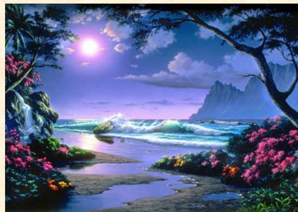
Last year's Homecoming Gathering

If you would like to discuss the upcoming event with other seekers and perhaps look into the possibility of carpooling and/or room sharing and/or flash mobbing, please visit Homecoming's thread on the Bring4th Forums on in the “Meet-Up Area” forum.