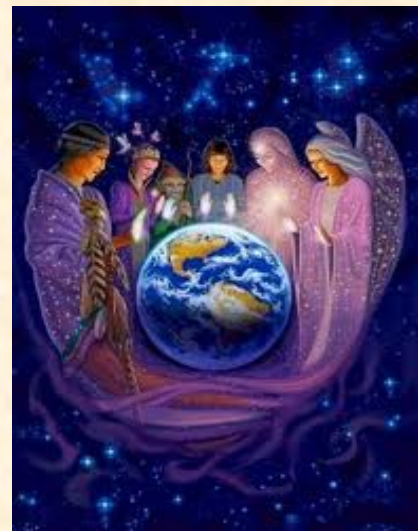
Not a literal depiction of LLR

Likely all who serve under this banner are wanderers with a connection to assisting in bringing forth the birth of fourth density. And in the larger sense, we are connected with all wanderers and seekers the world over who, by virtue of the depth of their realization of oneness with the Creator, assist in lightening the planetary vibration.